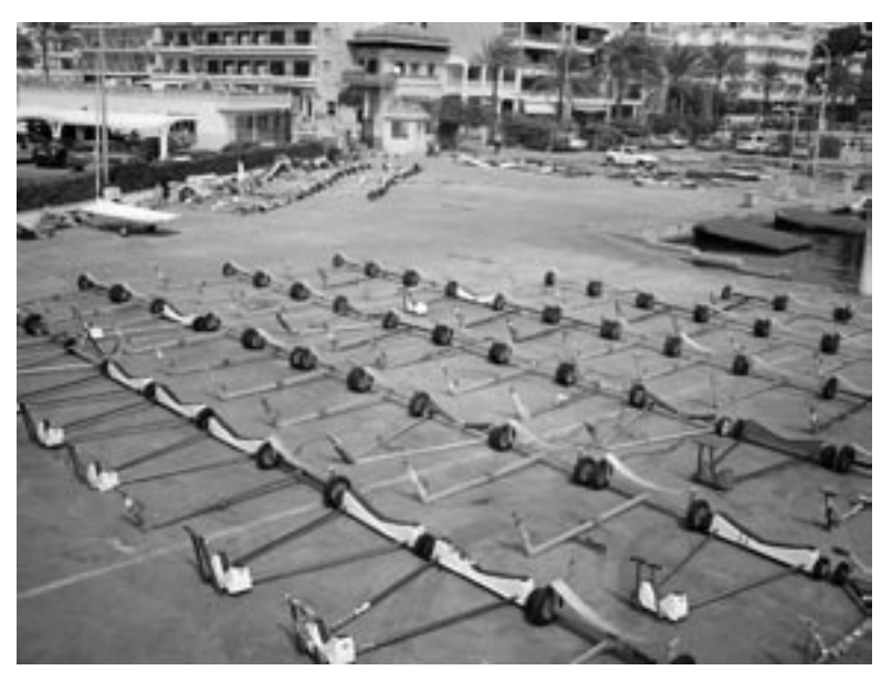
Club San Antonio de la Playa – March 05 – They've gone out at sea, did you ever see that ?